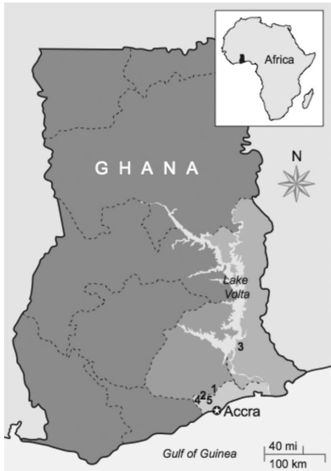
1 Pokrom 2 Amasaman 3 Dzemeni 4 Oduman 5 Pokuase — Country Border - - - - - Region Border

Forty-nine households across five villages (Figure 1) were included in analyses; one household in Pokuase was dropped from the water quality study, because another household was sampled in error at baseline. No households refused to take part in the water quality study. Quality control duplicate samples were all within an acceptable margin of error, and there was no detectable E. coli in the negative controls. Thirteen households dropped out of the study from the first year